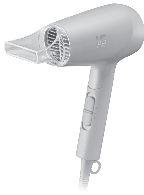
1400W IONIC TRAVEL DRYER 1400 瓦特 負離子旅行風筒 VS1736PIH