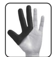
Universal Heat-Insulated Glove