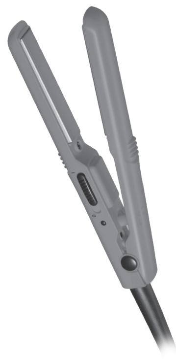
13MM CERAMIC STRAIGHTENER 13毫米陶瓷直髮器